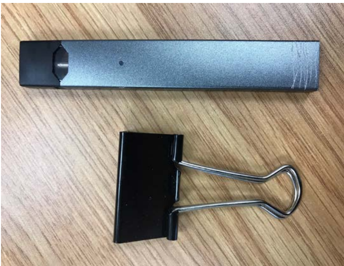
The JUUL with cartridge measures 3.75" in length.