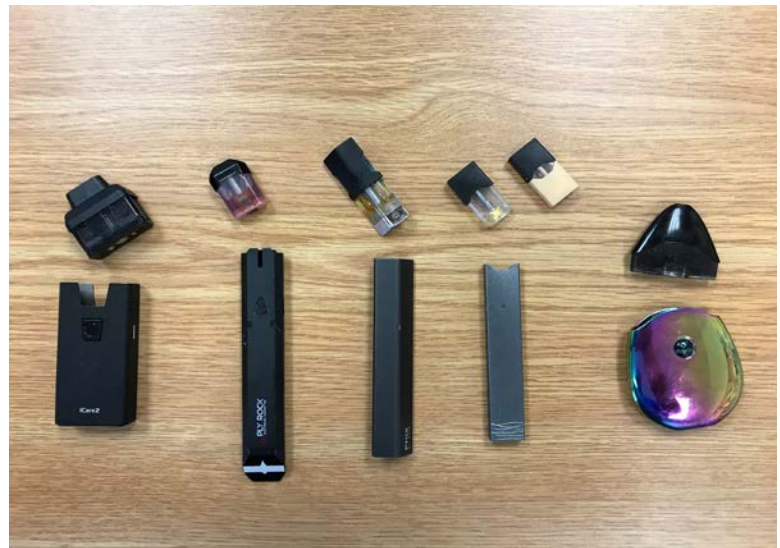
Different vaporizers with loadable flavored cartridges