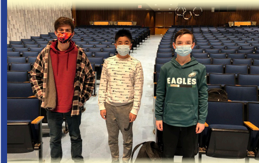
ABOVE: ETR GEOGRAPHY BEE WINNERS.