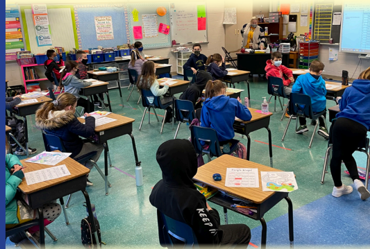
ABOVE: SCENIC STUDENTS ARE LEARNING IN THE CLASSROOM AGAIN.