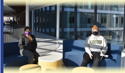
ABOVE: STUDENTS WEAR MASKS WHILE ON SCHOOL PROPERTY.