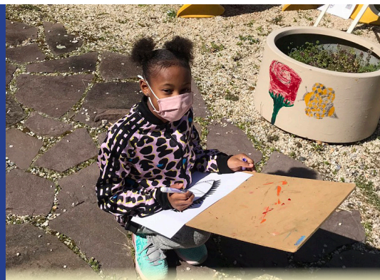
ABOVE: SABOLD STUDENT EXPRESSES HER CREATIVITY WHILE HAVING ART CLASS OUTSIDE.