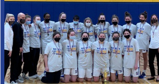
ABOVE: COUGAR GIRLS BASKETBALL CELEBRATE THEIR WINNING SEASON.