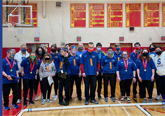
ABOVE: SHS STUDENTS CELEBRATED A WIN AT THE BOCCIE TOURNAMENT.