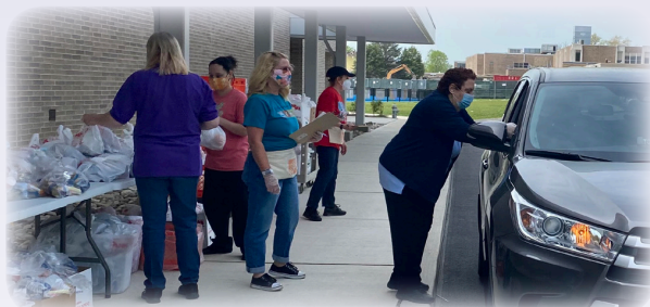
ABOVE: CHARTWELLS STAFF DISTRIBUTE MEALS TO THE COMMUNITY.