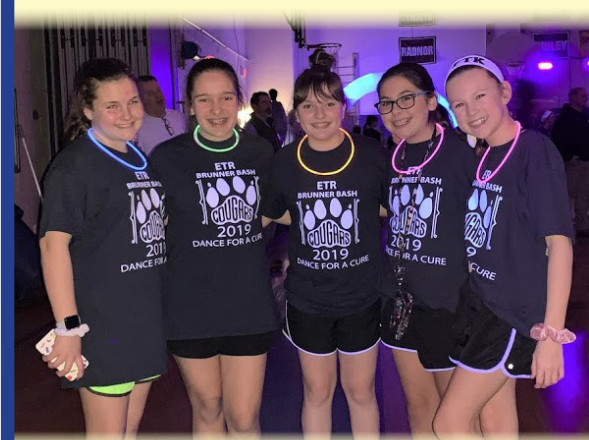
ABOVE: ETR STUDENTS CELEBRATING THE SUCCESS OF THE ANNUAL BRUNNER BASH