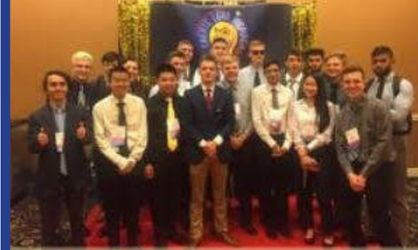
ABOVE: SHS FUTURE BUSINESS LEADERS OF AMERICA COMPETE AT THE FUTURE BUSINESS LEADERSHIP CONFERENCE IN HERSHEY, PA