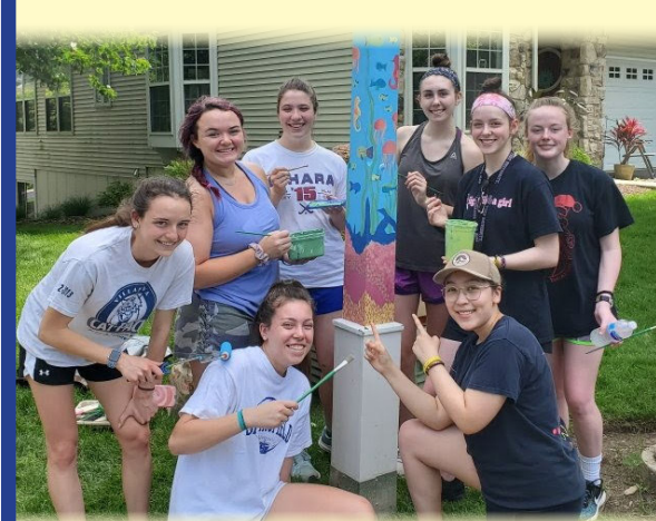
ABOVE: SHS NATIONAL ART HONOR STUDENTS PAINTING STREET POLES IN GOLF VIEW ESTATES AS PART OF A COMMUNITY OUTREACH PROGRAM