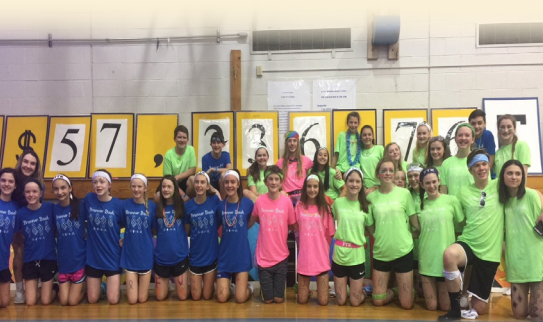
ABOVE: ETR STUDENTS CELEBRATE RAISING OVER $57,000 DURING THE 2018 BRUNNER BASH