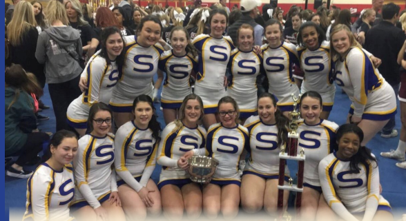
ABOVE: THE CHEERLEADING TEAM CELEBRATES AS DISTRICT CHAMPIONS