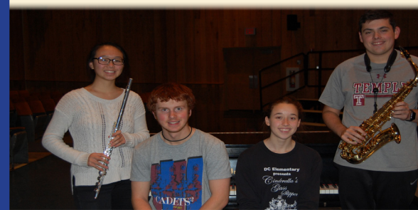
ABOVE: FOUR SHS STUDENTS EARNED SPOTS AT THE 2018 BAND AND CHORAL FESTIVALS