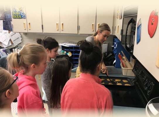
ABOVE: SABOLD STUDENTS WHIP UP TASTY TREATS IN THE COOKING CLUB