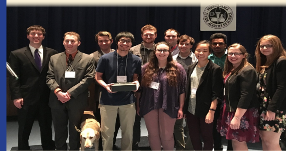
ABOVE: SHS STUDENTS REVEL IN THEIR TERRIFIC SHOWING AT THE PJAS COMPETITION