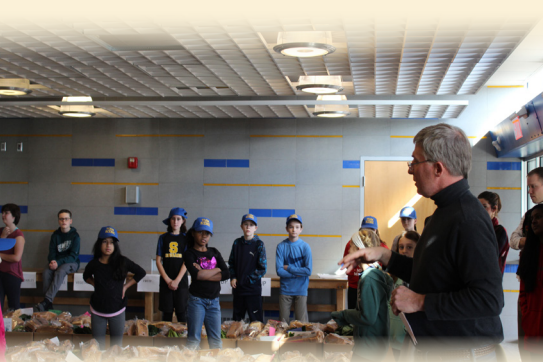
ABOVE: SCENIC HILLS STUDENTS HELP IN THE ANNUAL TURKEY FUND FUNDRAISER